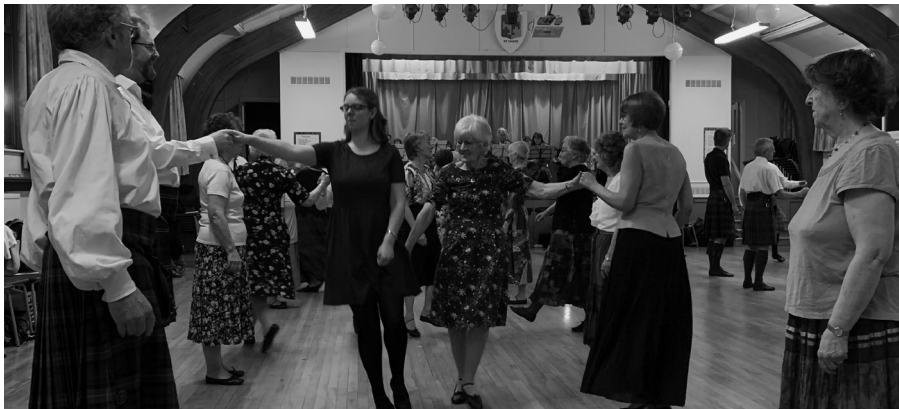
February Branch Dance