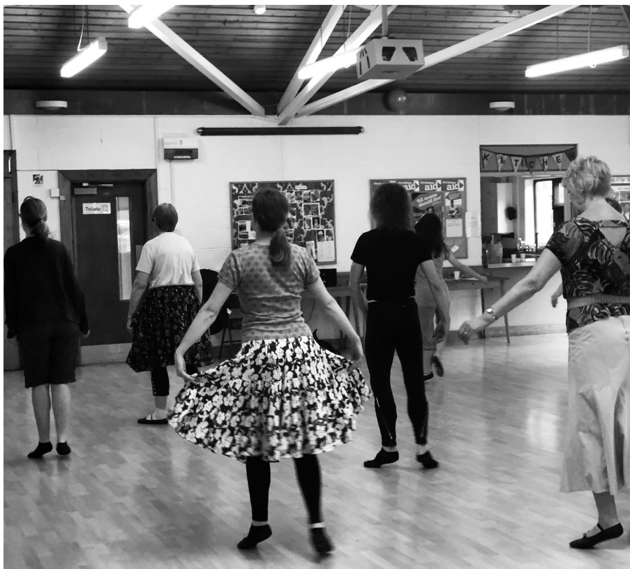
Blue Bonnets -Highland Day School

A great deal of fun is had so way not give the next Highland workshop a go on 5th October 2019.